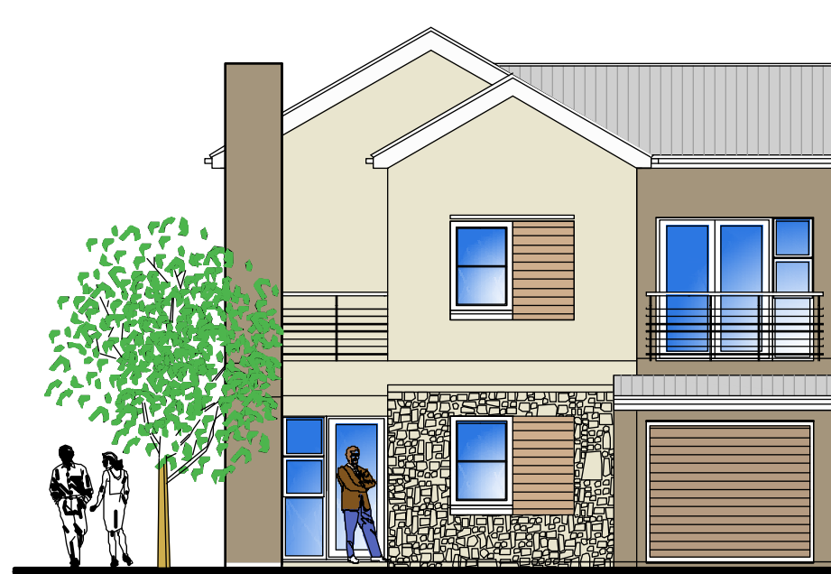
ELEVATION - TYPE E