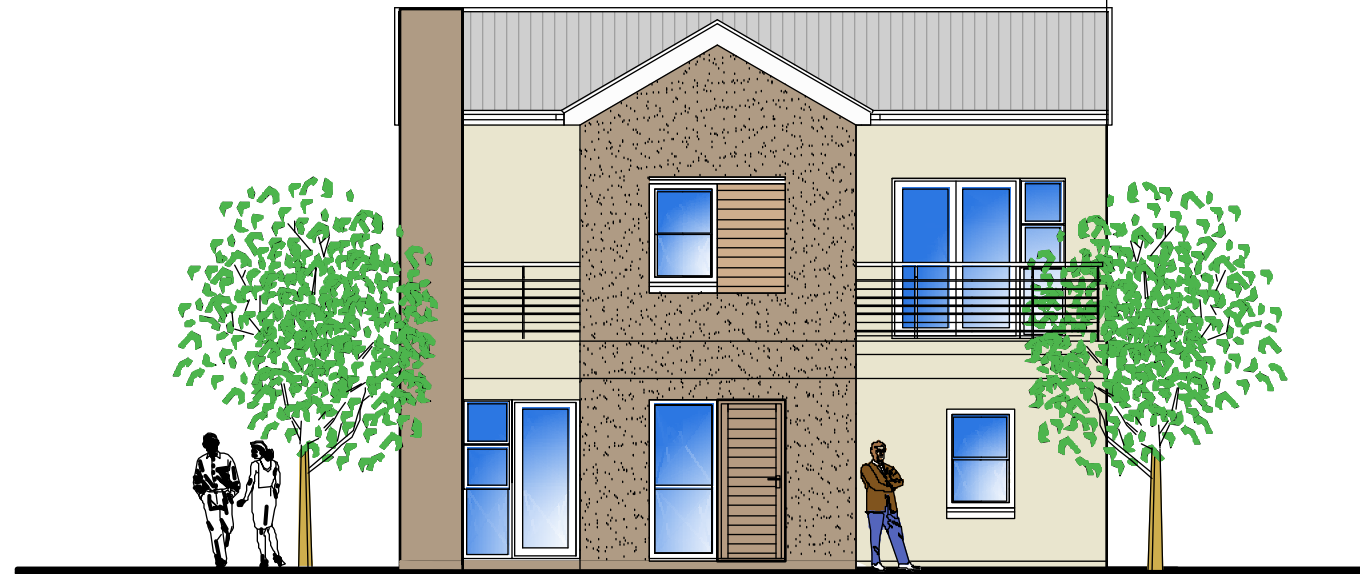
ELEVATION - TYPE A