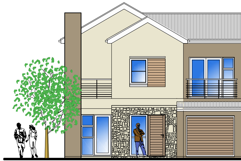
ELEVATION - TYPE B