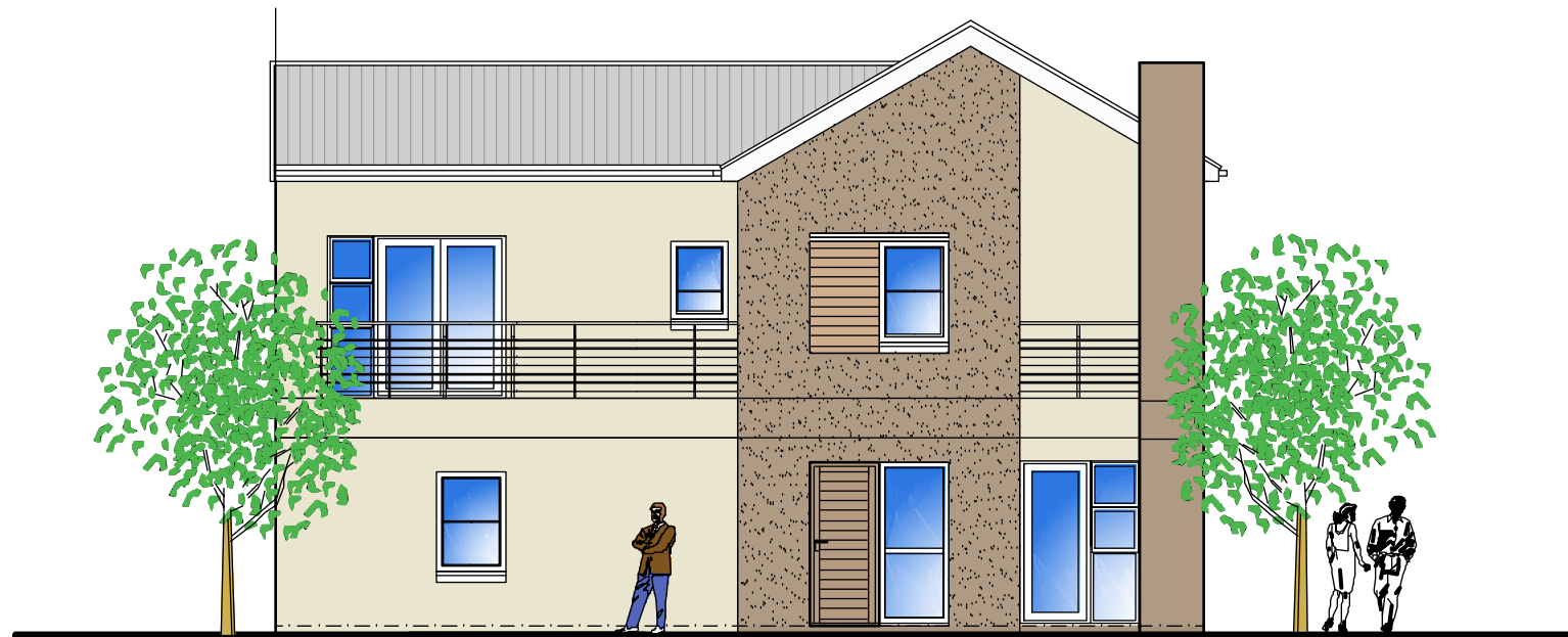
ELEVATION - TYPE C