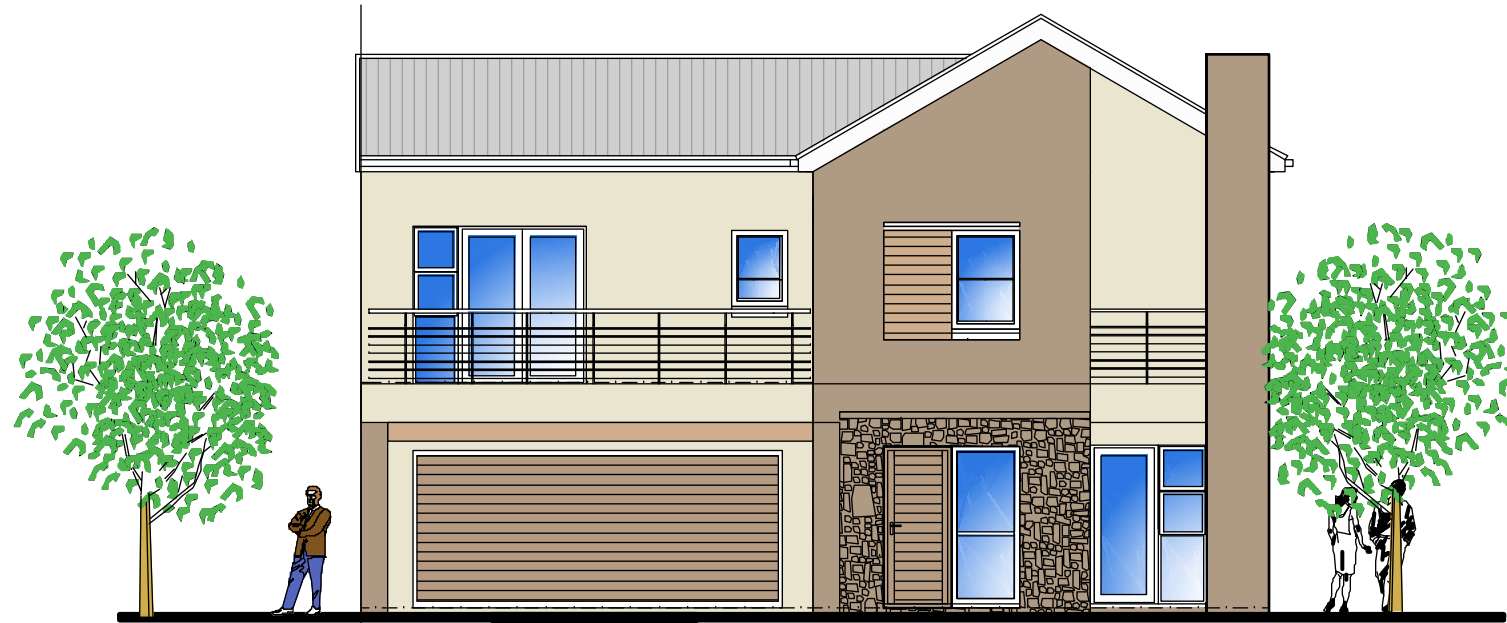
ELEVATION - TYPE D